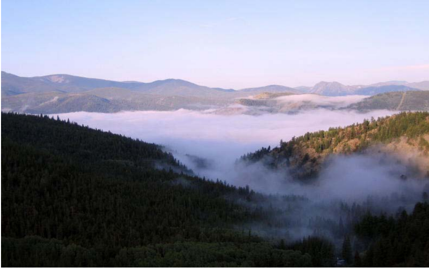
Colorado valley at sunrise. Northern Colorado.