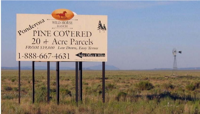
Attention all southern California homeowners. 20+ acres from $19,800. Central New Mexico.