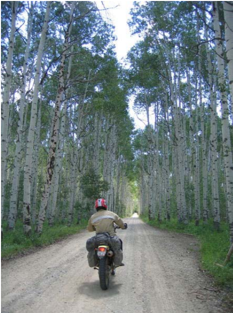
Brent Ross riding through a grove of aspens. Southern Wyoming.