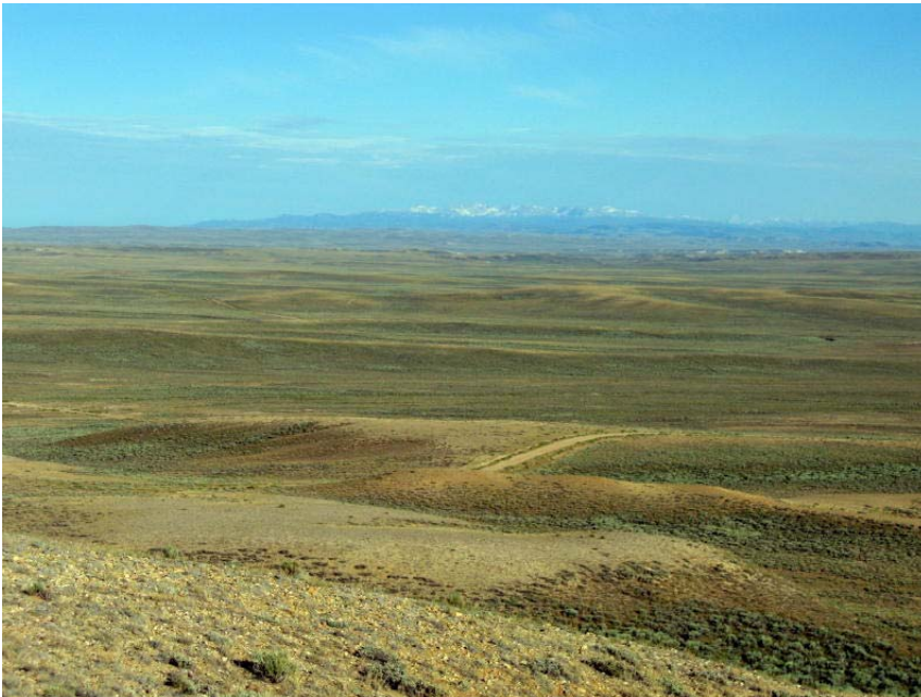
Typical Wyoming vista. Southern Wyoming.

PS – some photos of the last half of the trip follow