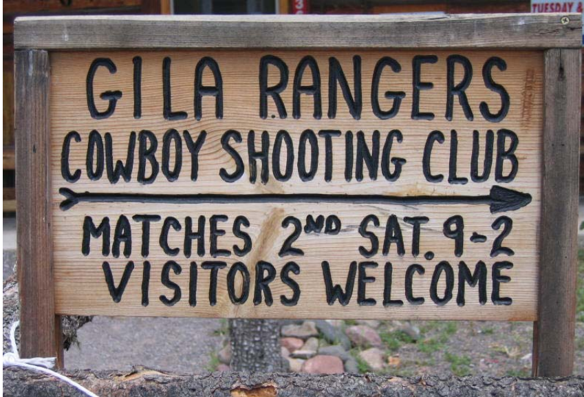
There was no indication of how many points you earned for each cowboy shot. Southern New Mexico.