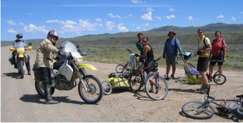
The Continental Divide riders convention, 2004. We came across these two groups of bicyclists riding the route. One group was headed north, the other south. They average about 5 liters of water per day. The northbound group was headed into a section where there was no water available for at least two days at their rate of travel. Southern Wyoming.