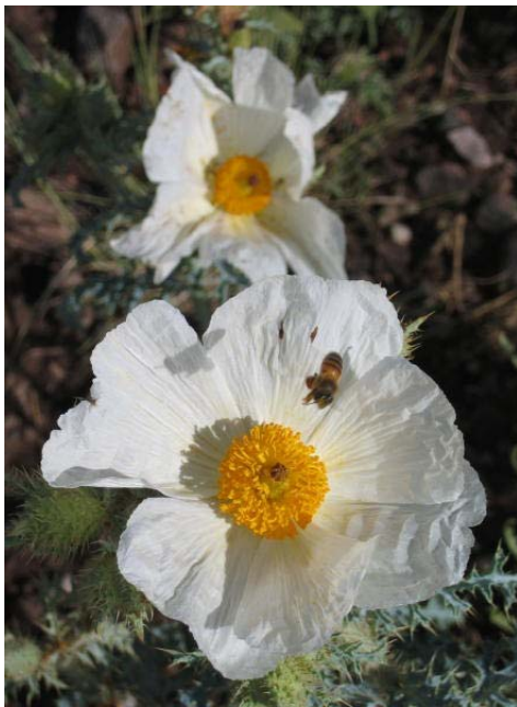
Thistle blossom with bee. Southern New Mexico.