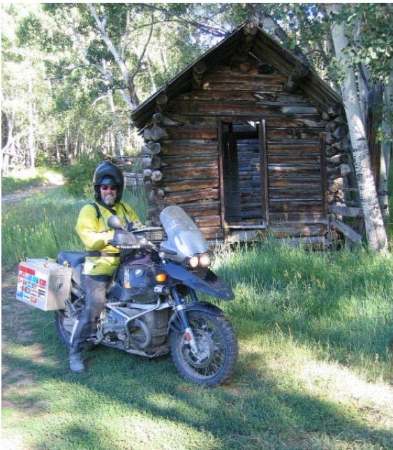
In front of an abandoned log cabin. Northern New Mexico.