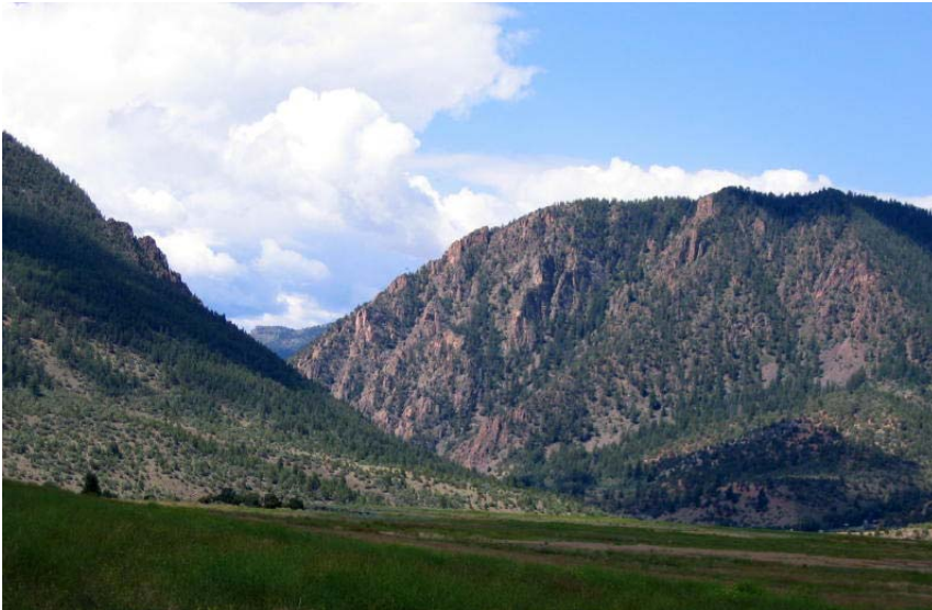
Typical Colorado view. Northern Colorado.